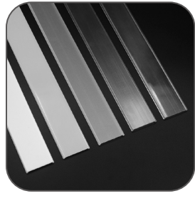
Alu Profile (Back)